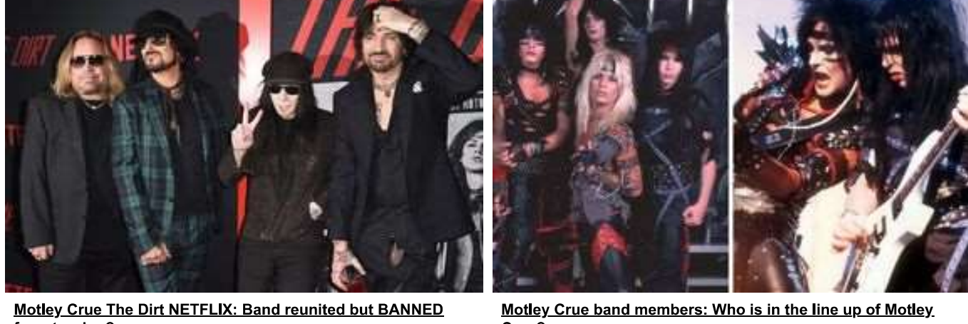
Mötley Crüe The Dirt NETFLIX: Band reunited but BANNED from touring? ( entertainment/music/1104106/Motley-Crue-The-Dirt-Netflix-metal-band-reunite-new-music-songs-four-ban-how-to-watch )