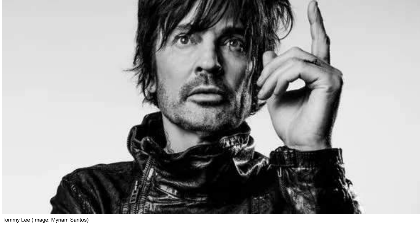
Tommy Lee