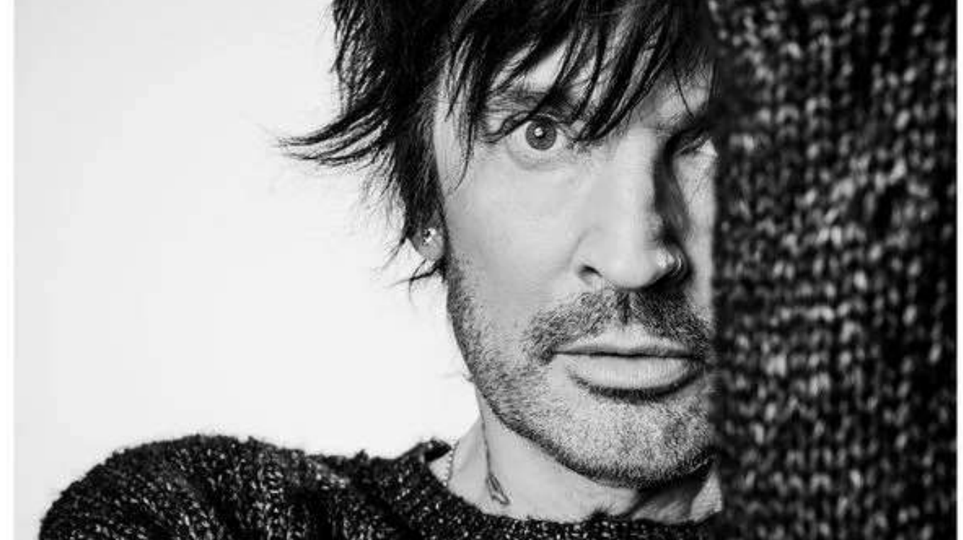
Tommy Lee

A: Everyone that I've talked to loves it, and of course you have your occasional haters who are like, "This is bullshit, man. It doesn't sound like Mötley." Well, it's not Mötley. Of course, it doesn't sound like Mötley. And it's not like this is some new thing. I've been doing this since 2000 with Methods of Mayhem which was my first solo venture. I've been cross-genre-pounding-hybrid making cool stuff since 2000. I don't think it's a big surprise to many people. The majority of people are digging it, and in Australia, the ANDRO album was number six on the Alternative Chart, which is super cool. Alternative and pop are kind of the same to me, and I love pop music. I love good music and I don't care whether it's pop or what genre it is. It's called pop because it's popular. At the end of the day, I just dig good music.